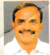
Dr. Y.S. Rajasekhara Reddy Hon'ble Chief Minister, Govt. of Andhra Pradesh

The JKC uplifts the rural youth by promoting self confidence among them and helps them secure employment on their own with professional zeal.