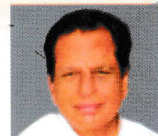
Sri R. Chenga Reddy Hon'ble Minister for Higher Education, Govt. of Andhra Pradesh